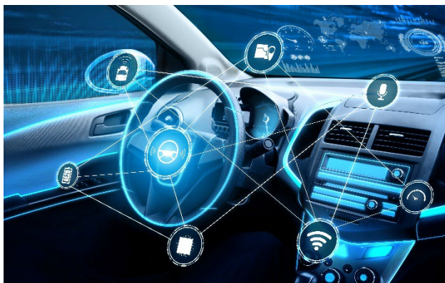
Image 2: ADTF is the comprehensive software framework for the development and testing of ADAS Functions up to autonomous systems.